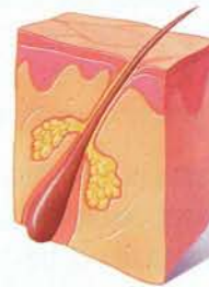
P. acnes absent